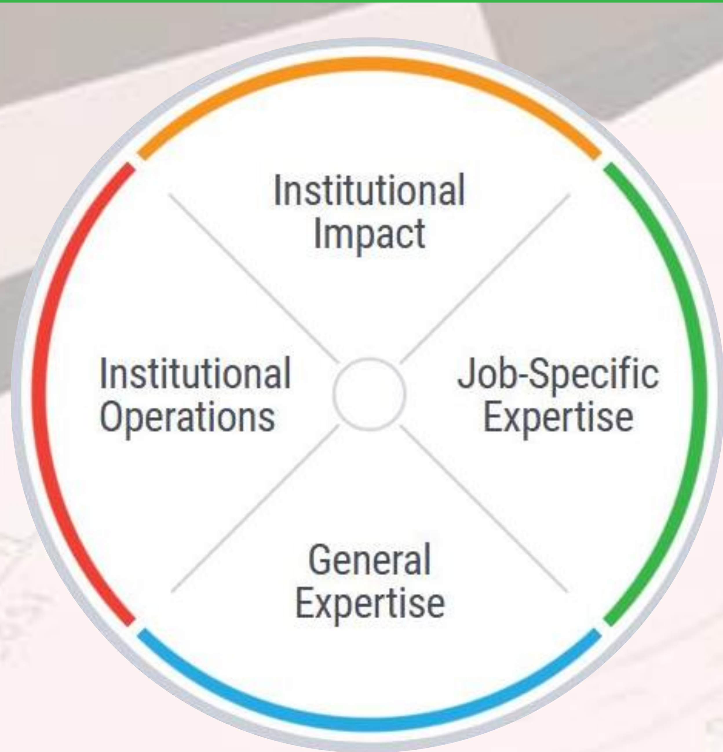
The ISL Framework includes four domains of competencies

“The ISL Framework is in essence a scaffold upon which we can set a series of [existing] resources for professionals” - Project PI