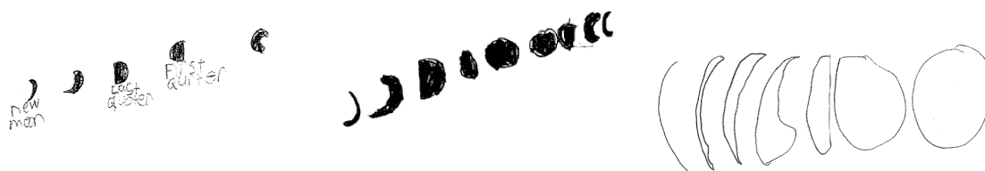
Figure 3. One student's drawings of the cycle of lunar phases: pre-instruction (random order), post-instruction (full cycle), and delayed-post (half-cycle, increasing pattern).

Conclusions and Implications: Similar to other educational studies, positive post-instruction results reflect the significant short-term impact that intensive instruction can have on children's understanding of science concepts. Perhaps, more important here was the duration of the desired conceptual change in many areas of the instruction. Similar to other longitudinal studies with students and pre-service teachers, some participants showed evidence of partial or full decay in their understanding of the target constructs