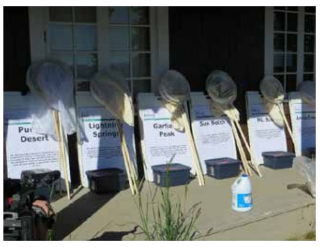
Figure 2: Inventory Gear Laid Out By Location

The first inventory had 3 public participants, a young man about 20 who was interested in insects, and his parents. In