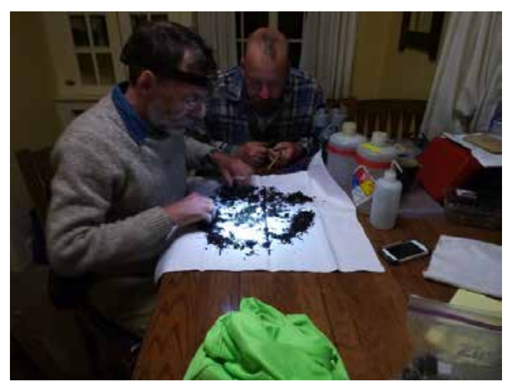
Figure 5: Post BioBlitz & Still Looking for Beetles