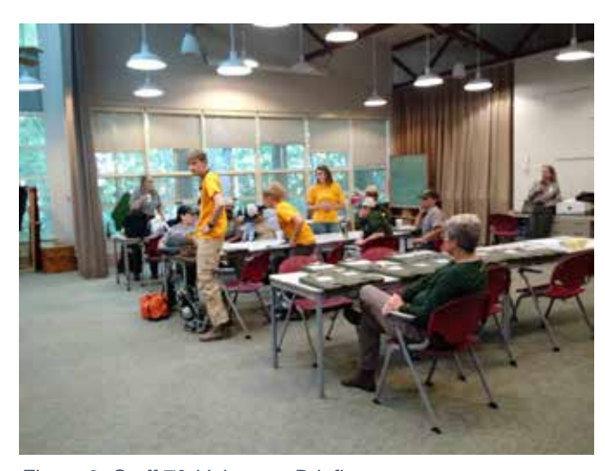
Figure 2: Staff 7& Volunteer Briefing

The park was well-prepared to handle the buses and students. In 2013, JELA held a BioBlitz for students and the public in partnership with National Geographic so staff had previous BioBlitz experience. In addition, the park holds programs for up to 2,500 students at a time so the 500 students at this event were easily managed. School bus parking was well-marked, paths had rope stanchions, and student meeting places were marked by big placards. In addition to park staff, the BioBlitz event had numerous volunteers helping out. The day started with a meeting for all staff and