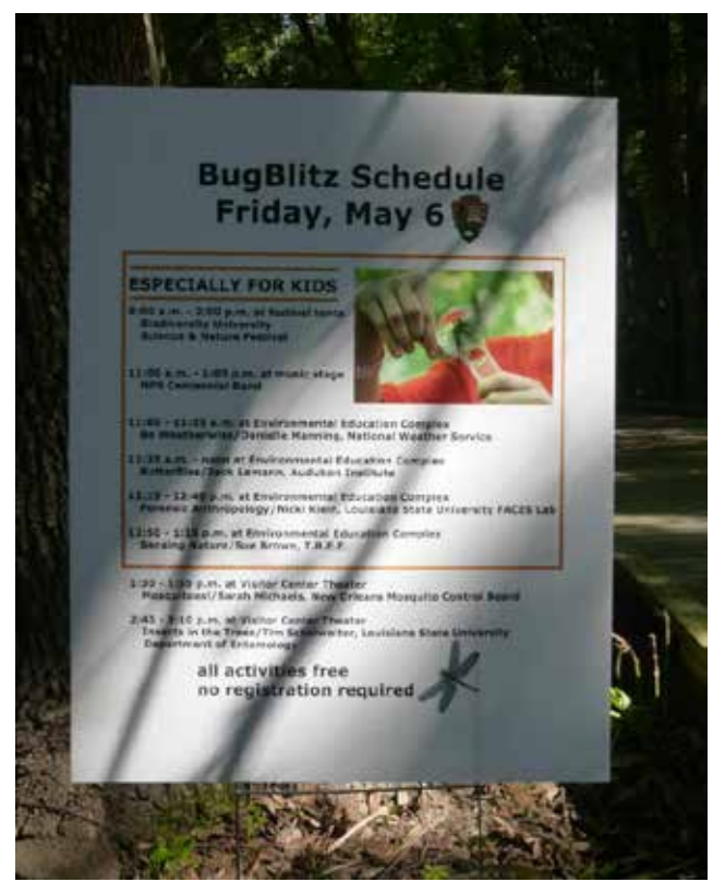
Figure 4: Park Schedule Poster

From 9 am to 2 pm, the focus was primarily on students; public participants were invited to participate in afternoon inventories. Most of the student groups brought their lunch and ate at the festival location. Half of the 17 schools had not visited the park before so this event was highly successful from the perspective of introducing students to the park.