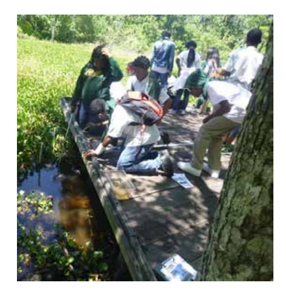
Figure 7: Aquatic Inventory