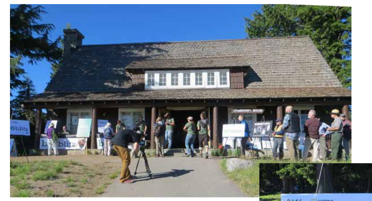
Figure 1: Community House Overlooking Crater Lake