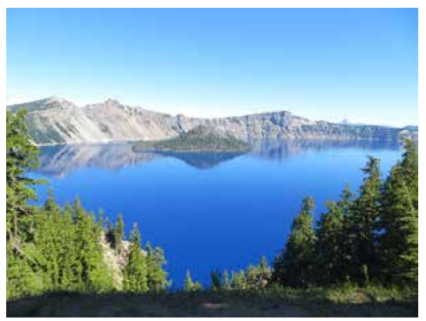
Crater Lake National Park. OR

Crater Lake National Park in southwest OR, features the deepest lake in the US, created by a collapsed volcano about 7,700 years ago. The park attracts mainly out-of-state visitors interested in seeing the immense, pristine blue volcanic lake. The surface of the lake is at approximately 6,000 feet and the ridge closer to 7,000 feet. There is one path that leads down to the water, 700 feet below the road, a number of other paths, some of which have views of the lake, and a ring road that circles the lake. The average visit is a half-day. Oregonians typically go to nearby Diamond Lake for recreation because the water is more accessible.