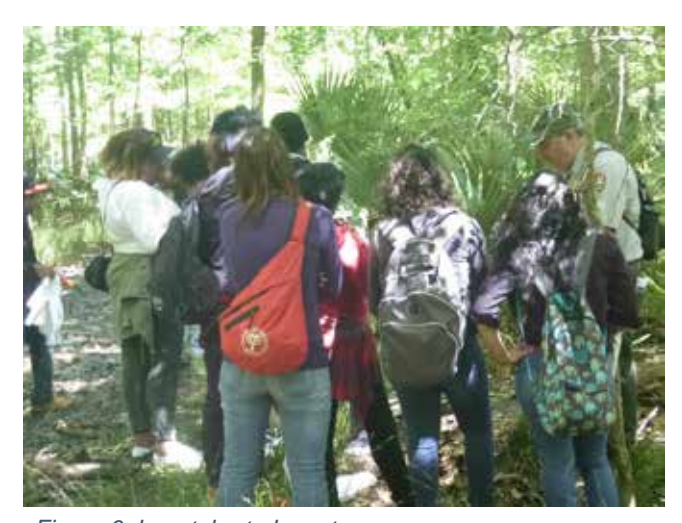
Figure 6: Invertebrate Inventory

The inventory leader described where and how to look for bugs and how to use the tools. He stressed the importance of not turning over rocks or logs or other insect habitats so as not to disturb life hiding there. He had a running conversation with students about the park environment and the insects they were, and were not, finding. Students were attentive a lot of the time but did lapse into conversations with their peers, and were clearly frustrated about their shoes getting covered with mud despite the teacher's warning them in advance to wear appropriate shoes. The students were finding few invertebrates aside from spiders but appeared to be learning about invertebrates and their habitats nevertheless.