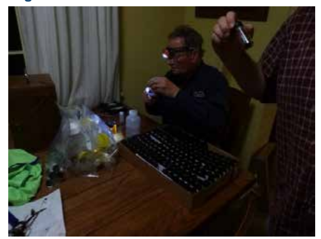
Figure 4: Scientists Preserving Specimens

There were workspaces in the house where everyone naturally gathered to talk, compare notes and procedures, and where they worked after BioBlitz to organize and preserve several hundred beetle specimens. (see photos).