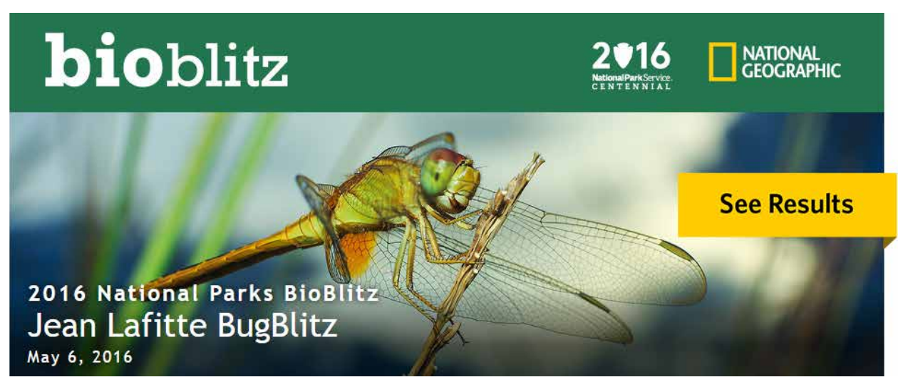
Figure 1: iNaturalist Outcomes http://www.inaturalist.org/projects/6457/stats_slideshow

BioBlitzes can be classified along a spectrum from a focus on scientific to a focus on participant learning and/or engagement with the park. Jean Lafitte National Historical Park and Preserve's (JELA) identified their priorities as follows: