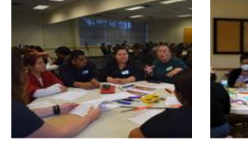
"Yo veo" mural